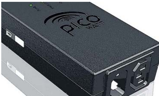
Tenrehte PICOwatt Smart Plug

The device also has WiFi connection to the Internet and also comes with Ethernet, a HDMI port, two USB ports and a slot for MicroSD cards and can also play Flash 10.1, MP3, DivX and a long list of video formats.